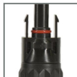
secure, airtight connection