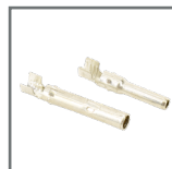
single connectors: contacts (pins) included