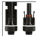
plug-socket connection: secured with a latch